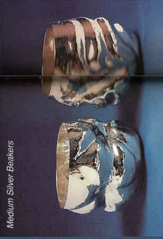
Medium Silver Beakers