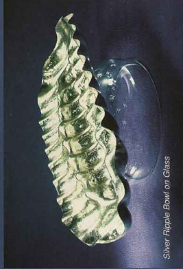
Silver Ripple Bowl on Glass