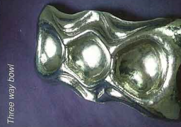
Three way bowl