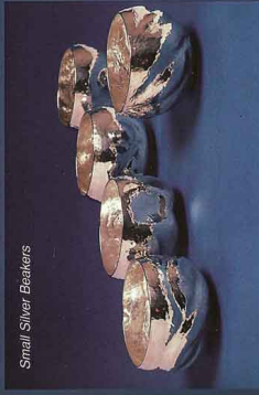
Small Silver Beakers