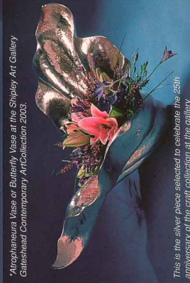
*Arophanaura Vase or Butterfly Vase at the Shipley Art Gallery Gateshead Contemporary ArtCollection 2003.

This is the silver piece selected to celebrate the 25th anniversary of the craft collection at the gallery