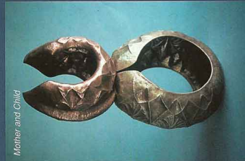
Mother and Child